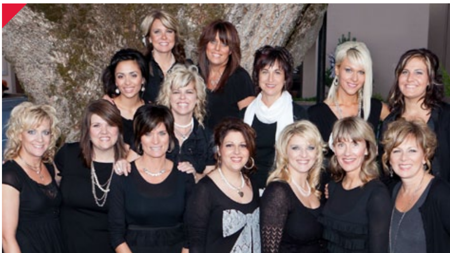
Staff of Salon Ambiance give back to the community by raising funds for scholarships.

The generous staff and clients at Salon Ambiance wanted to support their industry, give back to the local community and help the next generation. Oh, what to do?