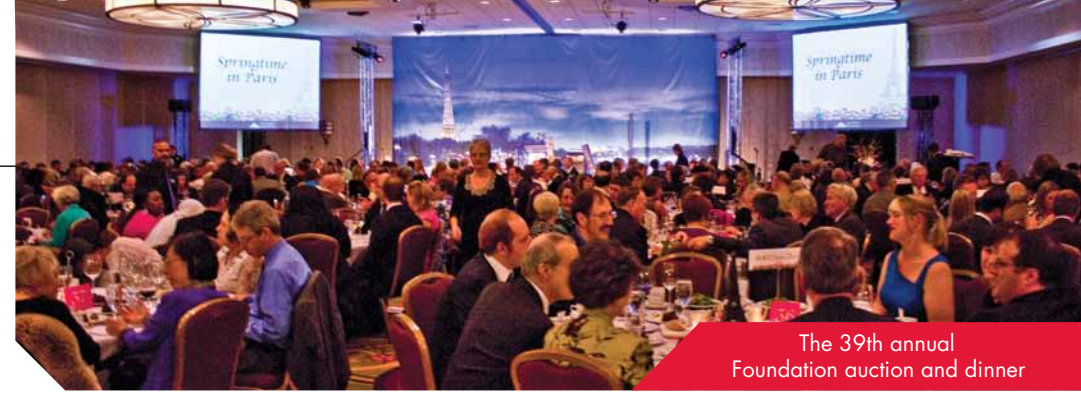
The 39th annual Foundation auction and dinner

Join us May 19, 2012, for the 40th annual Foundation auction and dinner. The Power of the Dream is in your hands. Check your mailbox and mhcc.edu/foundation for updates. And, if you would like to inquire about sponsorships, reserve a table, donate an auction item or volunteer your time, please contact the Foundation at 503-491-7204.