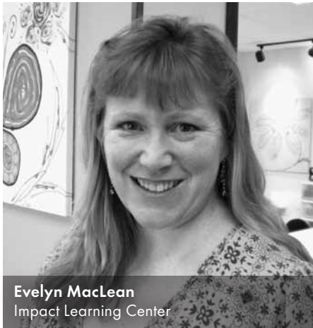
Evelyn MacLean Impact Learning Center

"SBDC at MHCC has been the best organization to work with in getting my business off the ground. The staff is incredibly knowledgeable, friendly and professional. From taking the Small Business Boot Camp class, to classes on Quick Books, the guidance from SBDC has been more than I could have hoped for."