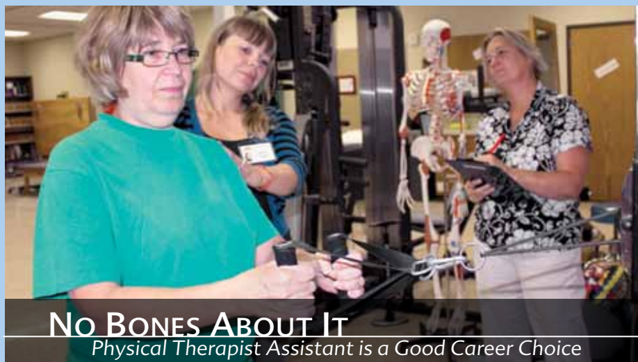
NO BONES ABOUT IT Physical Therapist Assistant is a Good Career Choice

MHCC launched one of the five original PTA training programs in the nation back in 1970, and has remained a leader in the four